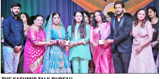
THE KASHMIR TALK BUREAU UDHAMPUR:

NISD Beauty & Designing Institute Udhampur hosts first BRIDAL Fashion Show