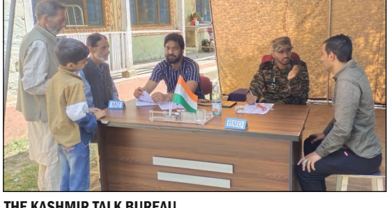
THE KASHMIR TALK BUREAU KISHTWAR :

Indian Army Dul organised a medical and veterinary camp at Swid village, Dachhan region of Kishtwar district to address the growing healthcare needs of the locals in the village of Swid in Dachhan region and its surrounding areas. The camp aimed to provide essential medical services to the residents of the region, who often need to travel to Kishtwar for both minor and major health issues concerning people and livestock.