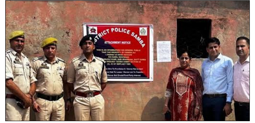
THE KASHMIR TALK BUREAU SAMBA:

Acting sternly against narcotics smuggling and suppliers, J&K Police today under Operation Sanjeevani seized 2 properties of drug peddler under Section 68F (Chapter 5A) of Narcotics & Psychotropic Substances Act.