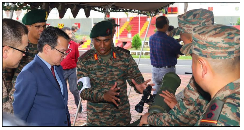
THE KASHMIR TALK BUREAU NEW DELHI:

The 16th edition of the India-Mongolia Joint Military Exercise NOMADIC ELEPHANT commenced today at the Foreign Training Node in Umroi, Meghalaya. Scheduled from July 3rd to 16th, 2024, this exercise marks a significant annual training event, conducted alternately in India and Mongolia. Last year's edition took place in Mongolia in July 2023.